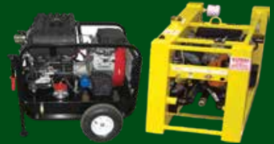
Hydraulic Power Units